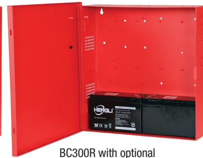
BC300R with optional 12VDC/7AH batteries