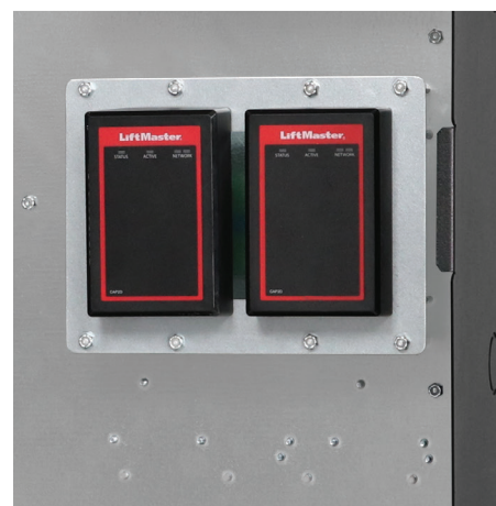
LMBK2 with Two (2) LiftMaster 2-CAP2D modules (not included) , mounted on a backplane inside a Trove enclosure