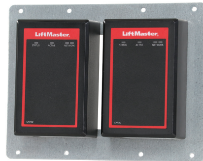
LMBK2 with Two (2) LiftMaster 2-CAP2D modules (not included)