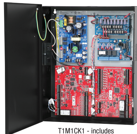
T1M1CK1 - includes eFlow4NB, PDS8, VR6, ACM4, wire harnesses and wire magnets