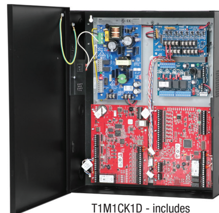
T1M1CK1D - includes eFlow4NB, PDS8CB, VR6, ACM4CB, wire harnesses and wire magnets