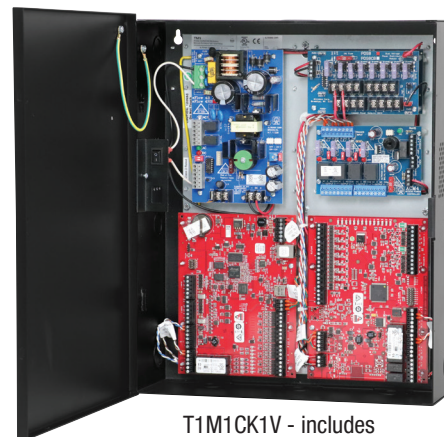
T1M1CK1V - includes eFlow4NBV, PDS8, VR6, ACM4, wire harnesses and wire magnets