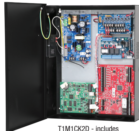
T1M1CK2D - includes eFlow4NB, PDS8CB, VR6, ACM4CB, wire harnesses and wire magnets