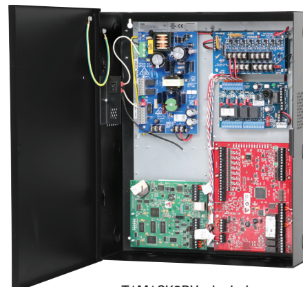
T1M1CK2DV - includes eFlow4NBV, PDS8CB, VR6, ACM4CB, wire harnesses and wire magnets