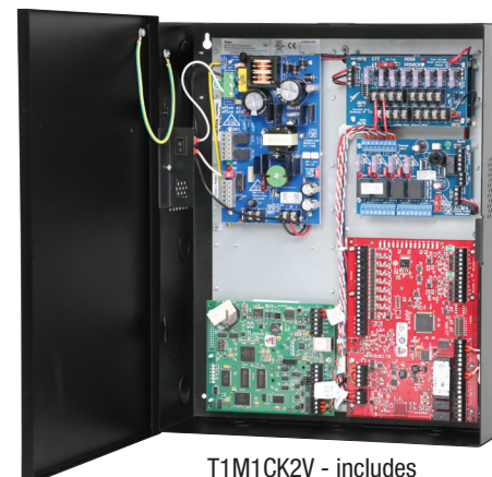
T1M1CK2V - includes eFlow4NBV, PDS8, VR6, ACM4, wire harnesses and wire magnets