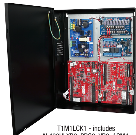
T1M1LCK1 - includes AL400ULXB2, PDS8, VR6, ACM4, wire harnesses and wire magnets