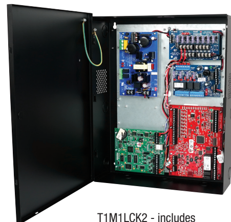
T1M1LCK2 - includes AL400ULXB2, PDS8, VR6, ACM4, wire harnesses and wire magnets