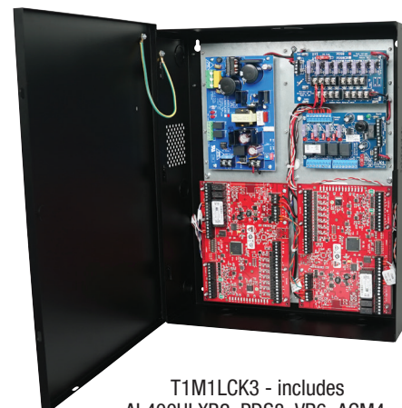
T1M1LCK3 - includes AL400ULXB2, PDS8, VR6, ACM4, wire harnesses and wire magnets