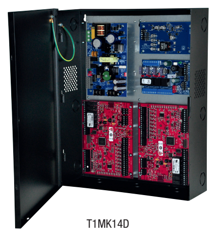
Mercury boards are not included