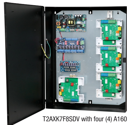
T2AXK7F8SDV with four (4) A1601 DIN Rail is not included