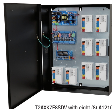
T2AXK7F8SDV with eight (8) A1210

Axis Communications boards are not included