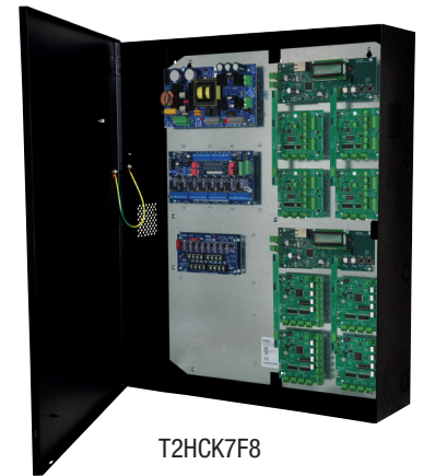
Hartmann Controls boards sold separately

Altronix T2HCK7F8 kit consists of Trove2 enclosure and THC2 Hartmann Controls/Altronix backplane with 24VDC @ 10A power supply/charger, 12VDC voltage regulator, eight (8) fuse protected output dual voltage power distribution module and eight (8) fuse protected output access control module. This kit also accommodates up to two (2) PRS_MASTER and eight (8) PRS_TDM, PRS_IO8 modules for up to sixteen (16) doors in a single enclosure. Trove simplifies board layout and wire management, reduces installation time and labor costs.