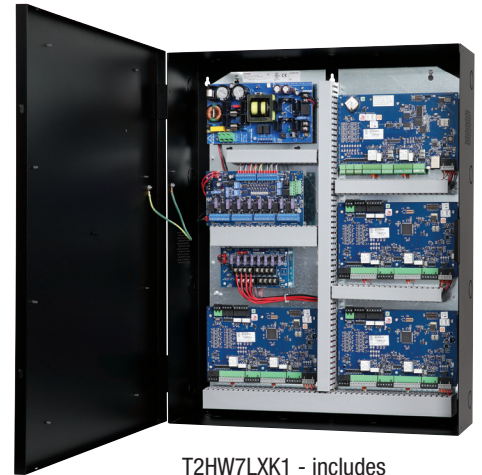
T2HW7LXK1 - includes AL1024ULXB2, ACMS8, VR6, PDS8, wire harnesses and finger duct