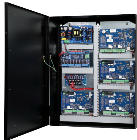
T2HW7LXK1D - includes AL1024ULXB2, ACMS8CB, VR6, PDS8CB, wire harnesses and finger duct