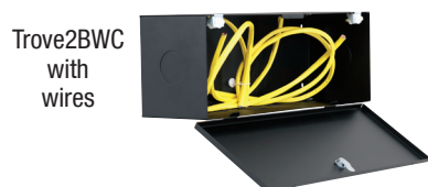
Trove2BWC with wires