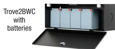
Trove2BWC with batteries

Altronix BR1 mounting bracket is compatible with Altronix Maximal and Trove enclosures. It allows to mount one (1) PD4UL(CB), PD8UL(CB), ACM4(CB), MOM5, VR6, PDS8, NetWay5B or LINQ8PD(CB) sub-assembly on the enclosure's inside wall, saving valuable space.