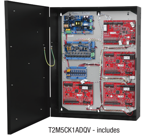
T2M5CK1ADQV - includes eFlow102NBV, LINQ8ACM8CB, PDS16CB, wire harnesses and management

AccessNsite, Avigilon, BadgePass, BluBox, Feenics, Genetec, Identocard, IMRON, Johnson Controls, Kastle, Keri Systems, Lenel/S2, LockState, Maxxess, Midpoint Security, NLSS, Open Options, Panasonic i-PRO MonitorCast, Quintron, RS2, S2 Security, Schneider Electric, Vanderbilt