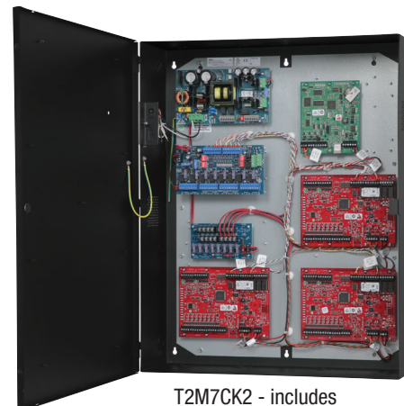
T2M7CK2 - includes eFlow104NB, ACMS8, VR6, PDS8, wire harnesses and management