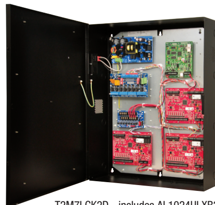
T2M7LCK2D - includes AL1024ULXB2, ACMS8CB, VR6, PDS8CB, wire harnesses and wire magnets