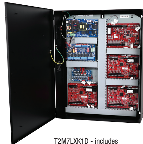
T2M7LXK1D - includes AL1024ULXB2, ACMS8CB, VR6, PDS8CB, wire harnesses and finger duct