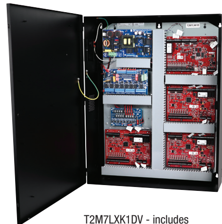
T2M7LXK1DV - includes AL1024XB2V, ACMS8CB, VR6, PDS8CB, wire harnesses and finger duct