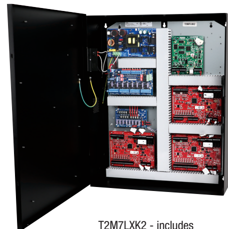
T2M7LXK2 - includes AL1024ULXB2, ACMS8, VR6, PDS8, wire harnesses and finger duct