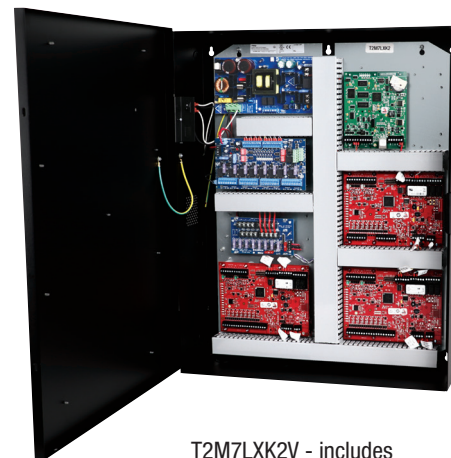
T2M7LXK2V - includes AL1024XB2V, ACMS8, VR6, PDS8, wire harnesses and finger duct