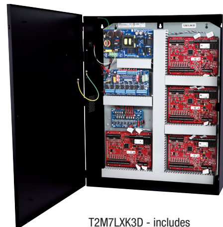
T2M7LXK3D - includes AL1024ULXB2, ACMS8CB, VR6, PDS8CB, wire harnesses and finger duct