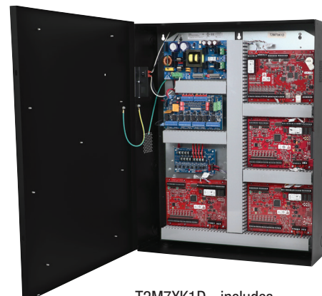
T2M7XK1D - includes eFlow104NB, ACMS8CB, VR6, PDS8CB, wire harnesses and finger duct

AccessNsite, Avigilon, BadgePass, BluBox, Feenics, Genetec, Identicon, IMRON, Johnson Controls, Kastle, Keri Systems, Lenel/S2, LockState, Maxxess, Midpoint Security, NLSS, Open Options, Panasonic i-PRO MonitorCast, Quintron, RS2, S2 Security, Schneider Electric, Vanderbilt