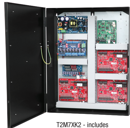
T2M7XK2 - includes eFlow104NB, ACMS8, VR6, PDS8, wire harnesses and finger duct