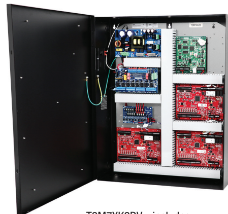
T2M7XK2DV - includes eFlow104NBV, ACMS8CB, VR6, PDS8CB, wire harnesses and finger duct

AccessNsite, Avigilon, BadgePass, BluBox, Feenics, Genetec, Identicon, IMRON, Johnson Controls, Kastle, Keri Systems, Lenel/S2, LockState, Maxxess, Midpoint Security, NLSS, Open Options, Panasonic i-PRO MonitorCast, Quintron, RS2, S2 Security, Schneider Electric, Vanderbilt