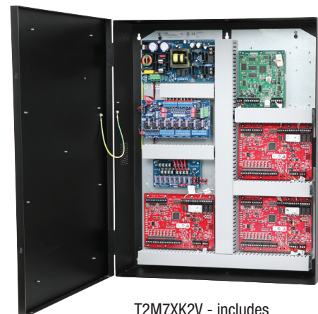
T2M7XK2V - includes eFlow104NBV, ACMS8, VR6, PDS8, wire harnesses and finger duct