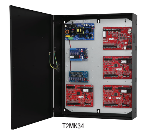
Mercury boards are not included