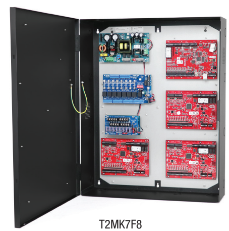
Mercury boards are not included