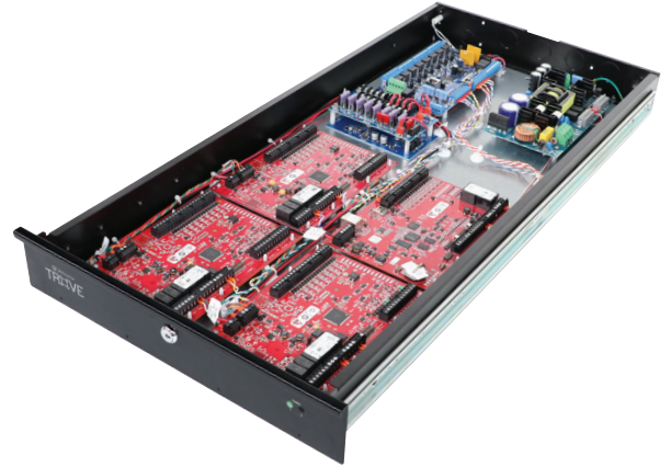
T2RM7CK1DQ - includes eFlow104NB, LINQ8ACMCB, VR6, PDS8CB wire harnesses and management

Altronix T2RM7CK1DQ is a 8-door managed access and power integration kit which includes Altronix power and sub-assemblies along with factory installed wire management and wire assemblies that are pre-configured with terminal blocks for Mercury* hardware. This unit provides ample power and dual voltage outputs to support Mercury platform controllers and locking devices. The T2RM7CK1DQ accommodates one (1) Intelligent Dual Reader Controller and three (3) Dual Reader Interface Modules. Trove Plus simplifies field installations and provides reliable, robust critical power and control for the most demanding applications.