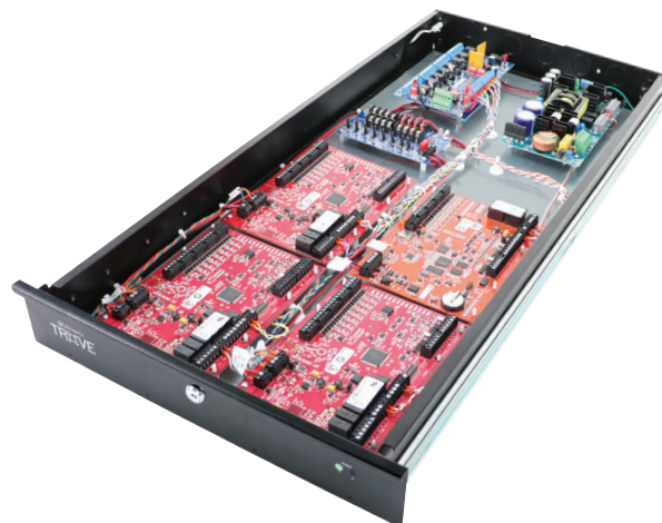
T2RM7CK1DV - includes eFlow104NBV, ACMS8CB, VR6, PDS8CB, wire harnesses and management

AccessNsite, Avigilon, BadgePass, BluBox, Feenics, Genetec, Identocard, IMRON, Johnson Controls, Kastle, Keri Systems, Lenel/S2, LockState, Maxxess, Midpoint Security, NLSS, Open Options, Panasonic i-PRO MonitorCast, Quintron, RS2, S2 Security, Schneider Electric, Vanderbilt