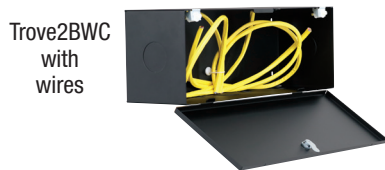
Trove2BWC with wires

Altronix Trove2BWC is a dual-purpose enclosure that can be used as wiring trough or battery cabinet when mounted above or below of the Trove2 integrated power and access solution. The knockouts on the Trove2BWC have been strategically placed to line up with the Trove2 allowing for easy conduit connections between cabinets. Trove2BWC includes cam locks and 2 tamper switches to ensure access to wiring and batteries is secure.