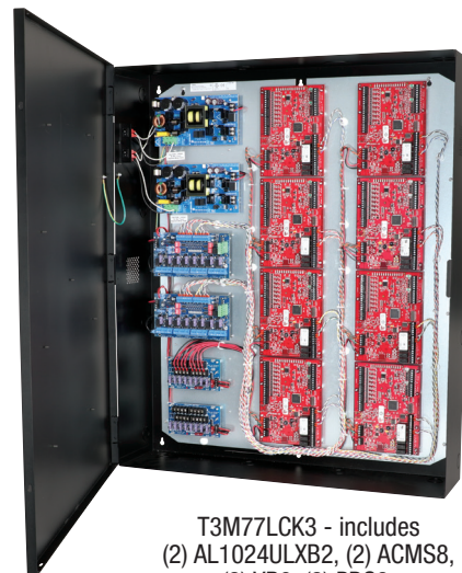
T3M77LCK3 - includes (2) AL1024ULXB2, (2) ACMS8, (2) VR6, (2) PDS8, wire harnesses and management