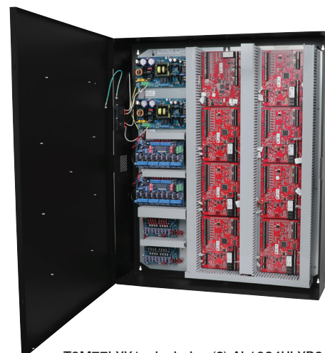
T3M77LXK1 - includes (2) AL1024ULXB2, (2) ACMS8, (2) VR6, (2) PDS8, wire harnesses and finger duct