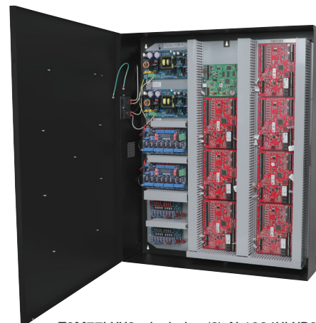
T3M77LXK2 - includes (2) AL1024ULXB2, (2) ACMS8, (2) VR6, (2) PDS8, wire harnesses and finger duct