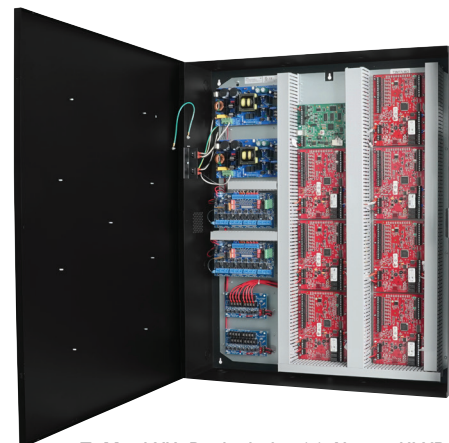
T3M77LXK2D - includes (2) AL1024ULXB2, (2) ACMS8CB, (2) VR6, (2) PDS8CB, wire harnesses and finger duct