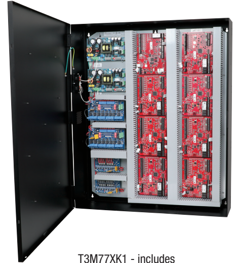
T3M77XK1 - includes (2) eFlow104NB, (2) ACMS8, (2) VR6, (2) PDS8, wire harnesses and finger duct