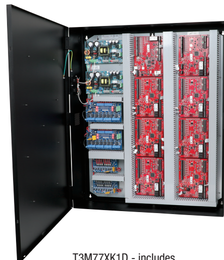
T3M77XK1D - includes (2) eFlow104NB, (2) ACMS8CB, (2) VR6, (2) PDS8CB, wire harnesses and finger duct