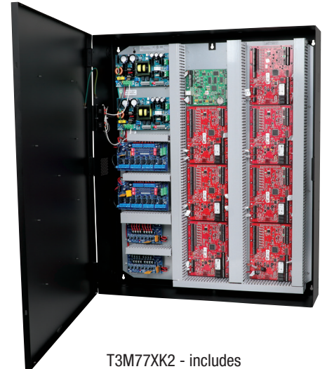
T3M77XK2 - includes (2) eFlow104NB, (2) ACMS8, (2) VR6, (2) PDS8, wire harnesses and finger duct