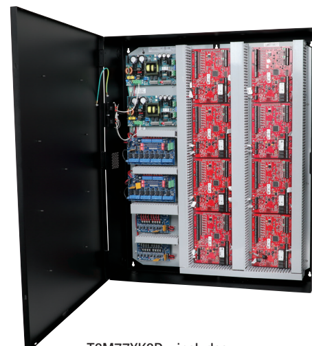
T3M77XK3D - includes (2) eFlow104NB, (2) ACMS8CB, (2) VR6, (2) PDS8CB, wire harnesses and finger duct