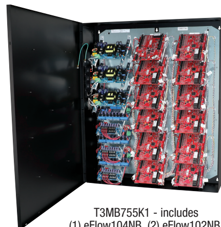
T3MB755K1 - includes (1) eFlow104NB, (2) eFlow102NB, (3) ACMS8, (3) PDS8, wire harnesses and management