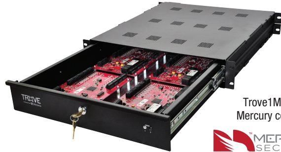
Trove1M1R with Mercury controllers