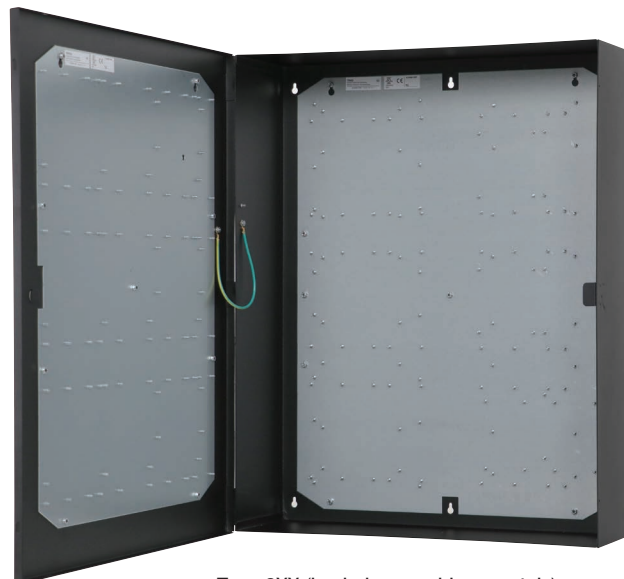
Trove2XX (backplanes sold separately)

Trove2XX enclosures accommodate a variety of Altronix backplanes which support access controllers and accessories from the industry's leading manufacturers, along with Altronix power distribution. These enclosures have no knockouts or venting holes for use in applications such as federal and military installations. Trove systems simplify board layout and wire management, reducing installation time and labor costs.